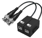
PFM800-E Passive HDCVI Balun